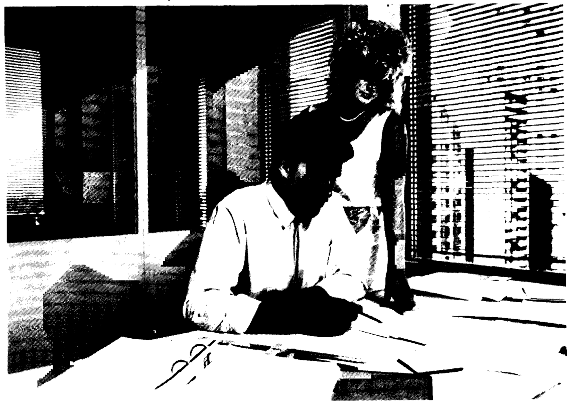
On the job training for a sandwich student

In December 1985 the 4 sandwich students who had been employed for that calendar year completed their placements. Another 4 students commenced work in the Office in January 1986.