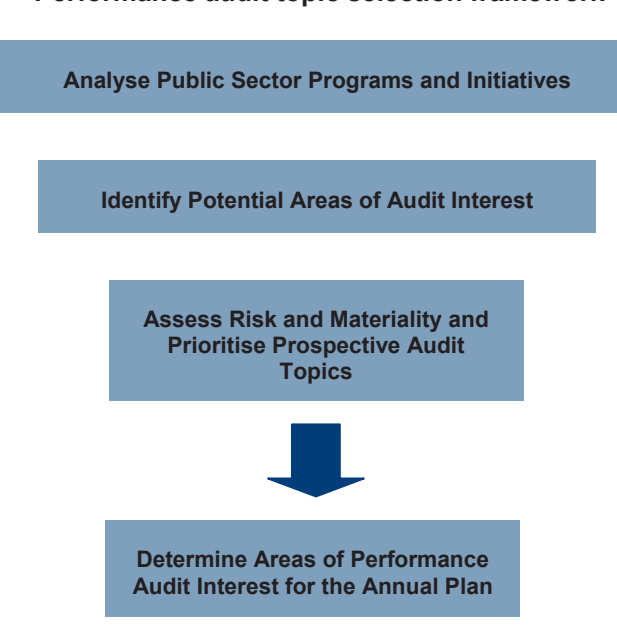
Figure 2A Performance audit topic selection framework

Figure 2A provides an overview of our performance audit topic selection framework which is described further below.