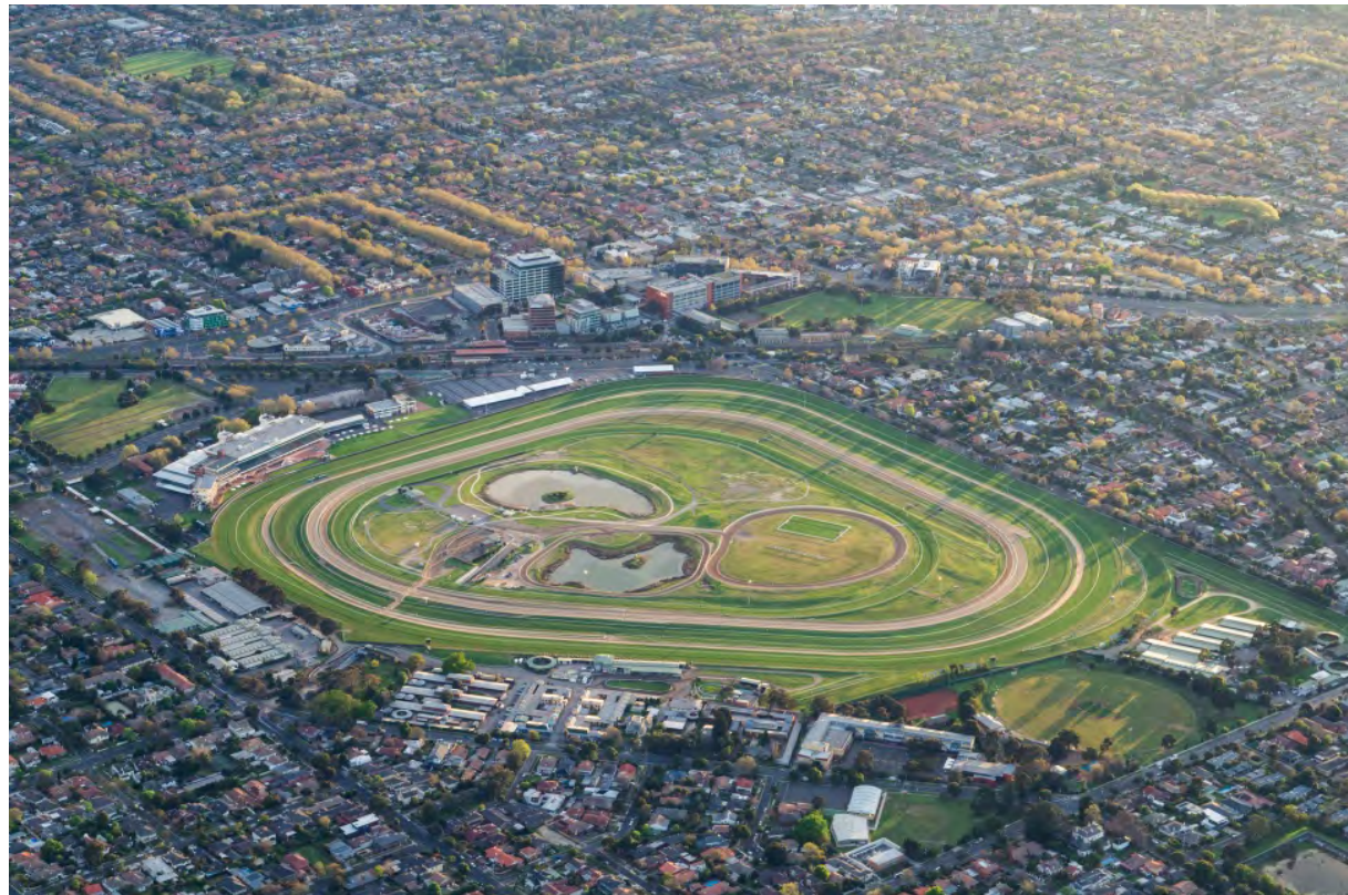
Aerial photo of Caulfield Racecourse Reserve.