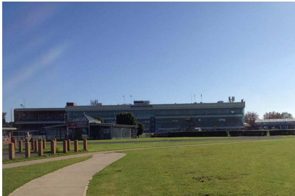
Centre of Caulfield Racecourse Reserve looking towards the grandstand.

If this fails alternative arrangements should be explored—e.g. creating a new legislative framework for the reserve.