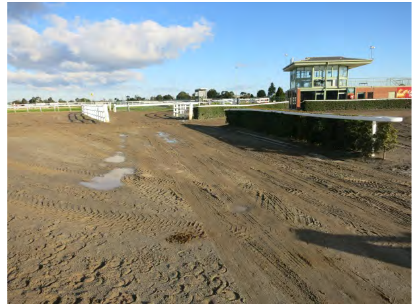
Public reserve—condition of the track from Glen Eira Road tunnel to car park.