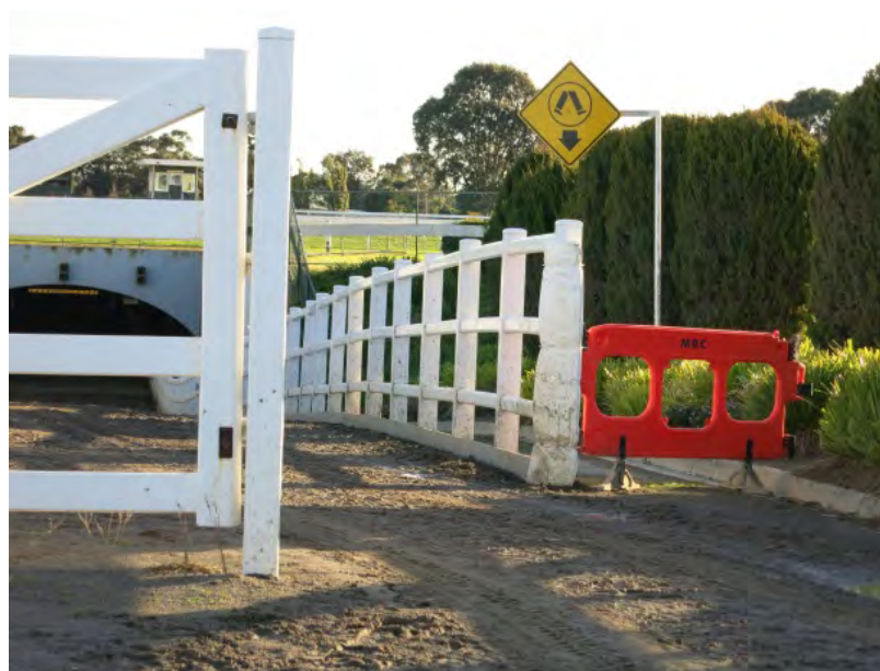
Pedestrian entrance via Glen Eira Road—blocked.