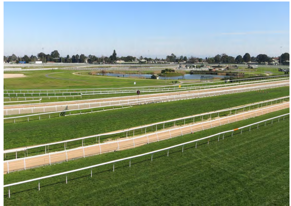
Encroachment of fencing on the reserve.

Insufficient attention has been paid to fulfilling the community-related purposes of the reserve.