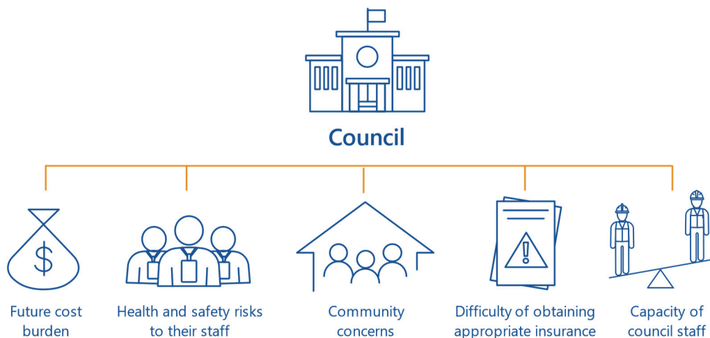
Figure 6: Stakeholder concerns about disposal points