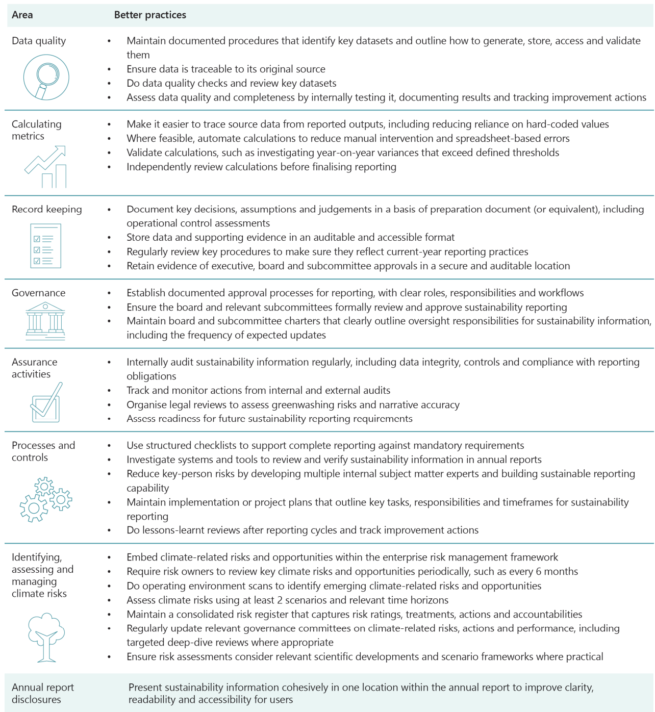
Figure D1: VAGO guidance for better practices for sustainability reporting

We developed this appendix to help Victorian public entities strengthen their sustainability reporting.